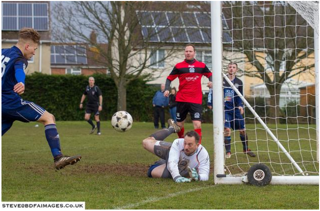
West Howe v Richmond Park Rangers...