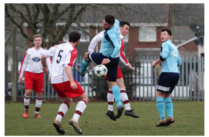
Poole Wanderers v Bournemouth Athletic

shaded it 2-1 against AFC Fiveways thanks to Oli Sommerfelt and Craig Noye.