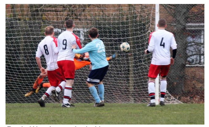
Poole Wanderers denied by great save.